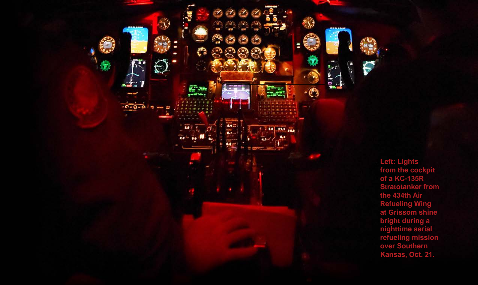
Left: Lights from the cockpit of a KC-135R Stratotanker from the 434th Air Refueling Wing at Grissom shine bright during a nighttime aerial refueling mission over Southern Kansas, Oct. 21.

The KC-135 has a system of exterior lights located on the belly of the aircraft just behind the nose gear and flood lights on the boom pod used to pass fuel to the receiver aircraft.