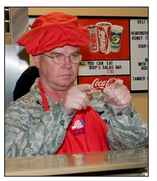
Col. Don Buckley, 434th Air Refueling Wing commander focuses in on his next customer during a Thanksgiving meal Nov. 3.

Calvin. "We served 600 pounds of meat; 16 turkeys, 75 pound steamship round roast and 20 hams."