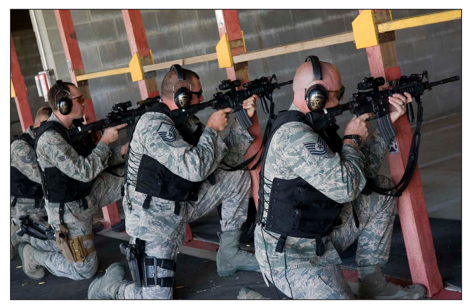
434th Security Forces Squadron members fire M-4 rifles during semi-annual performance training at the base firing range June 2. SFS airmen have to qualify with their weapons every six months, (U.S. Air Force photo/Senior Airman Jami Lancette)

"We have a unit that likes to deploy, all these people volunteer," said Russell.