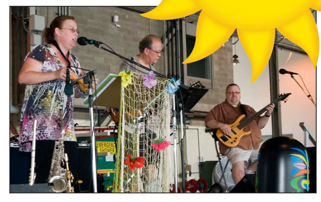
The Parrot Troupers band performs in Dock 6 during Grissom's Family Day July 7.

The purpose of Family Day is to show appreciation to the families of Grissom's personnel and the support they give their loved ones.