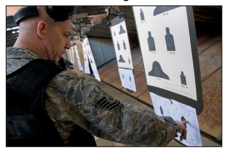
A 434th Security Forces Squadron member checks his target during training at the base firing range June 2.

range was no easy task; as they were there from sun up to sun down during the grueling two-day training in preparation for an upcoming deployment,