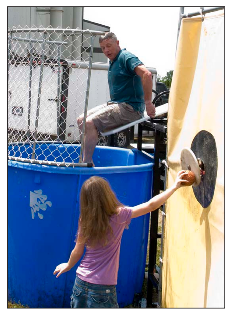
A young girl dunks someone the easy way during Family Day July 7. The event is held annually and includes various activities.