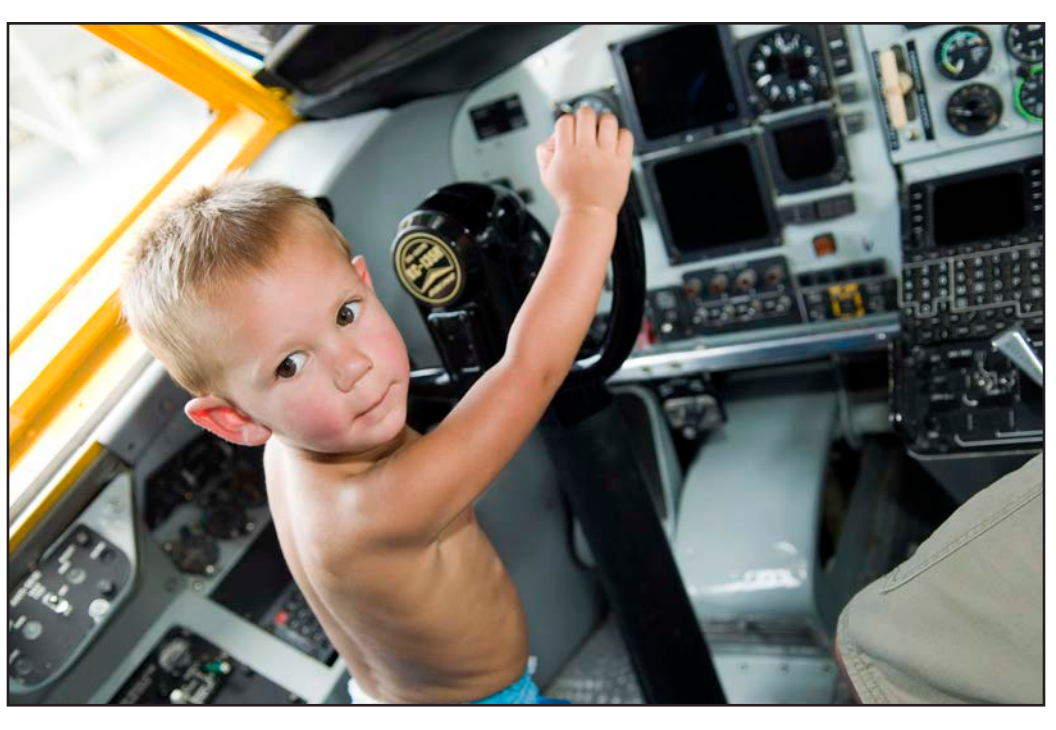
A child plays pilot in the cockpit of a KC-135R Stratotanker on display at Grissom Family Day July 7. Family Day is held annually to to show appreciation for the families of Grissom's service members.