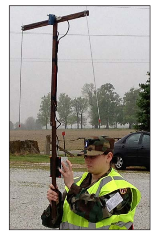
A member of the local Civil Air Patrol operates a radio direction finder during an exercise with the Grissom emergency management team.