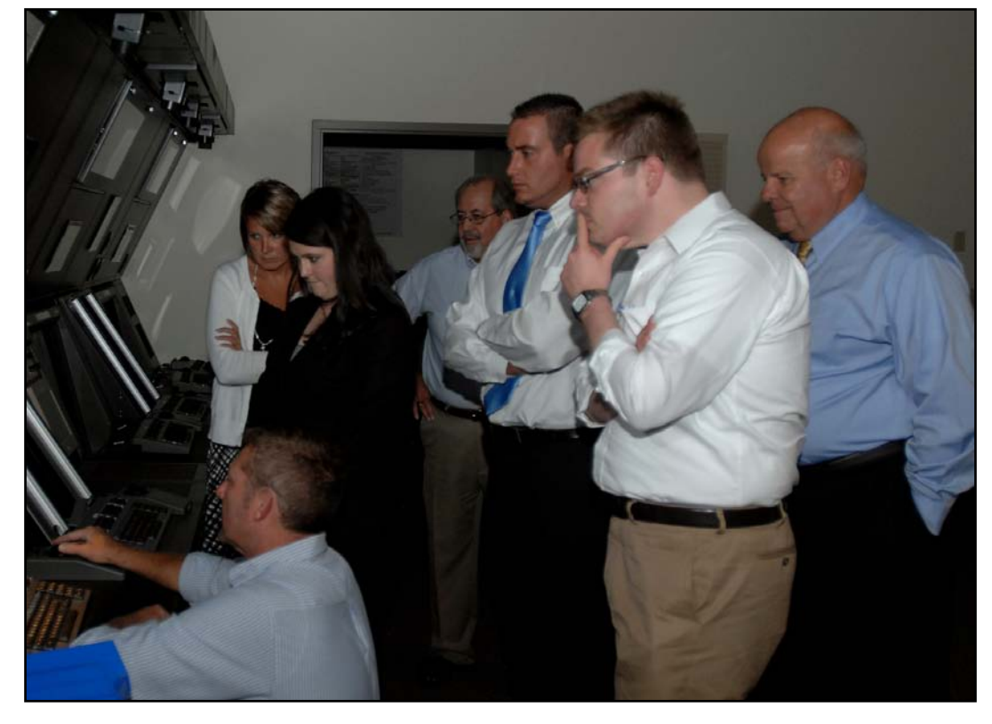
Congressional staff members visit the Grissom radar approach control flight instrument rule room during their visit here Aug. 9.

They then visited Grissom's radar approach control facility and observed air traffic controllers managing civilian,