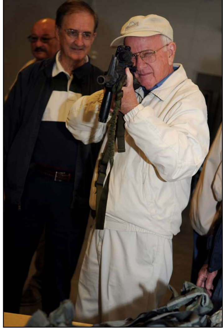
Members of Britton Falls Veterans group, visit the U.S. Army reserve's 316th Tactical Psychological Operations Company here Sept. 7.

The goal of the tour was to help the veterans gain perspective of operations here and the role that Grissom has not only in the military, but in the surrounding community.