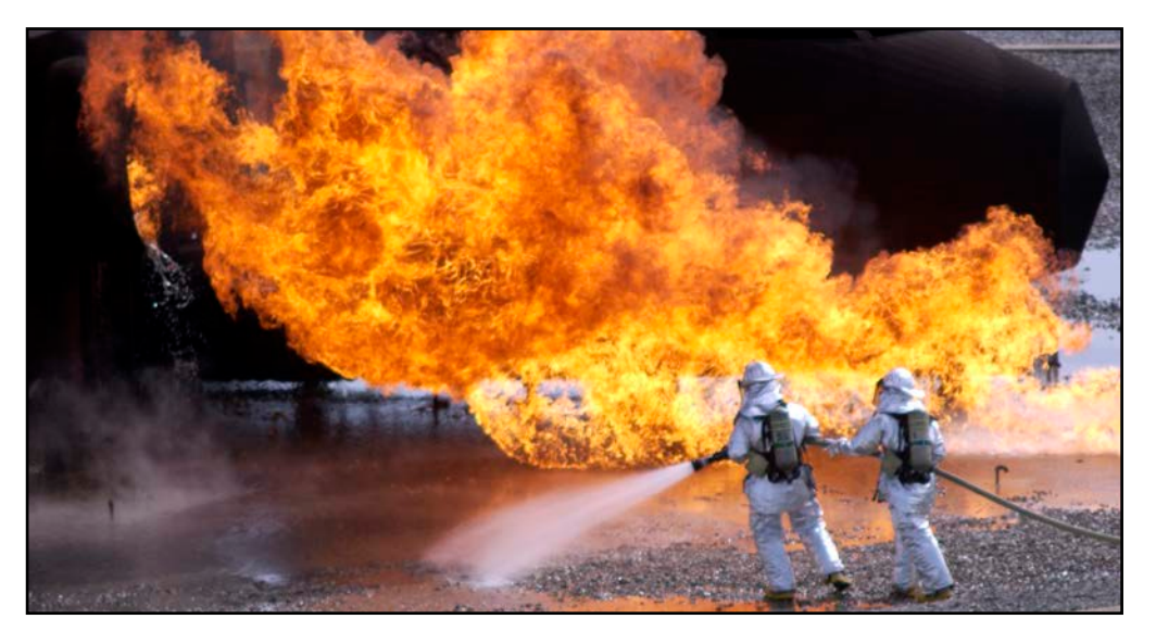
Firefighters move into position to attack a simulated aircraft fire her Aug. 23.

Grissom is often used as a training location for a variety of career fields who take advantage of the opportunities the base has to offer.