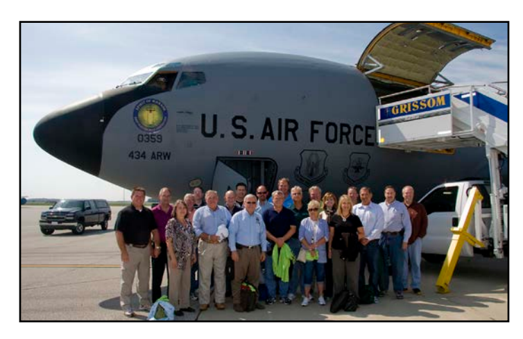
Indiana state legislators pose for a photo in front of a Grissom KC-135R Stratotanker shortly before taking off onboard the aircraft to witness first-hand the aerial refueling mission of the 434th Air Refueling Wing Aug. 17.

But, the lawmakers didn't just learn about Grissom's monetary impact, they also learned about the many intangible assets of having one of