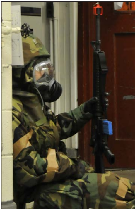
An Airman guards the entry control point for the transportation building shortly after an 'attack' during an operational readiness inspection.