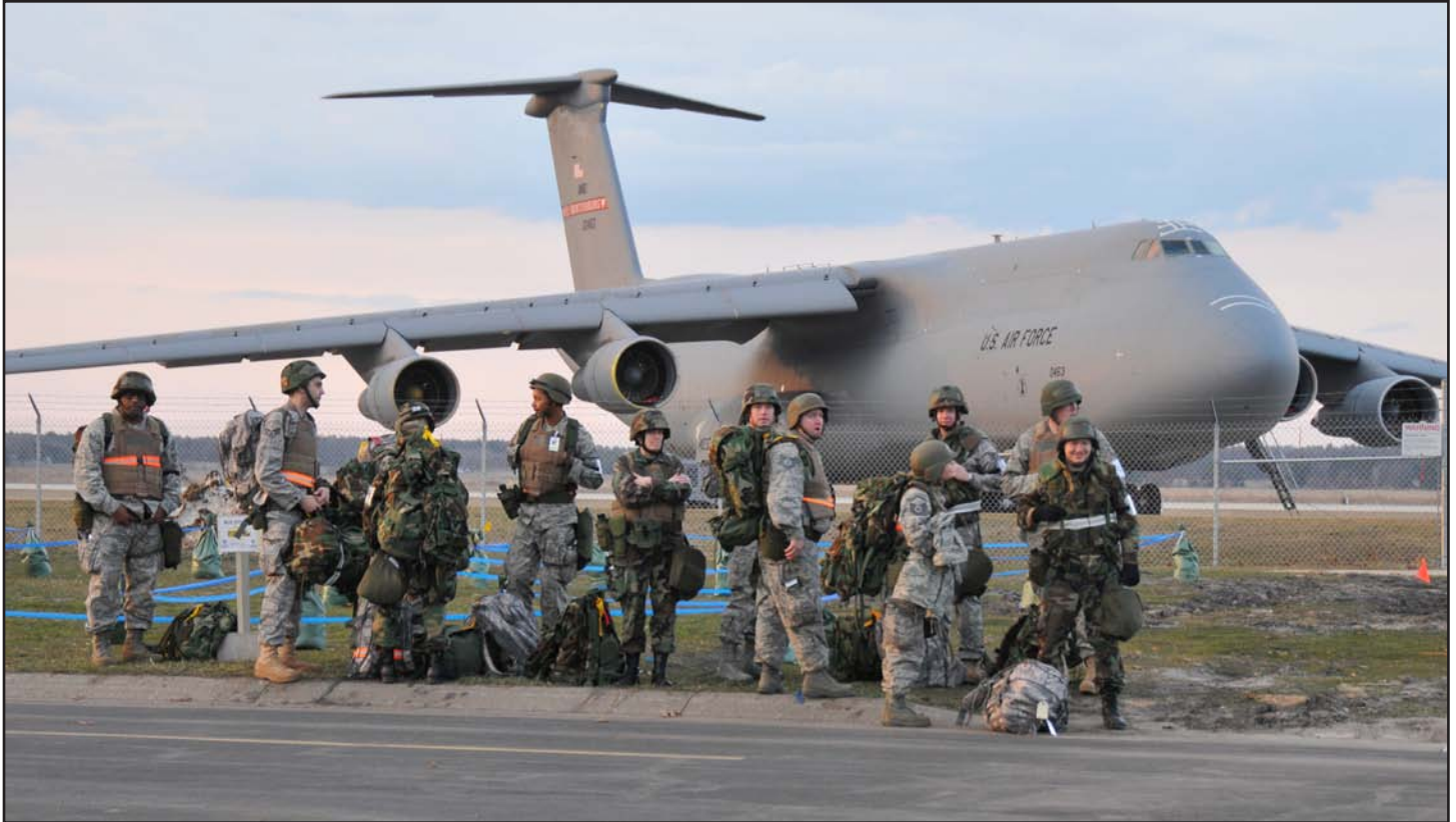
Members from Grissom and Martinsburg wait for a bus during the operational readiness exercise held recently. Official grades are for official use only and not releasable.