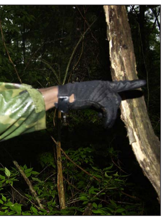
Squadron fire team leader, points out a path for ning. Security Forces members spent the day and rainy conditions.