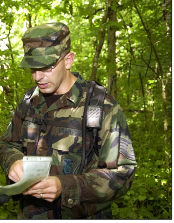
elee review a map and discuss how to get to ng held during the July unit training assembly. ty Forces Squadron members who honed their Cass County.