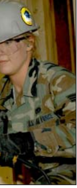
on apprentice, bores a uction.