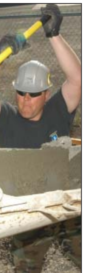
or, clears concrete out curb at the Southwest