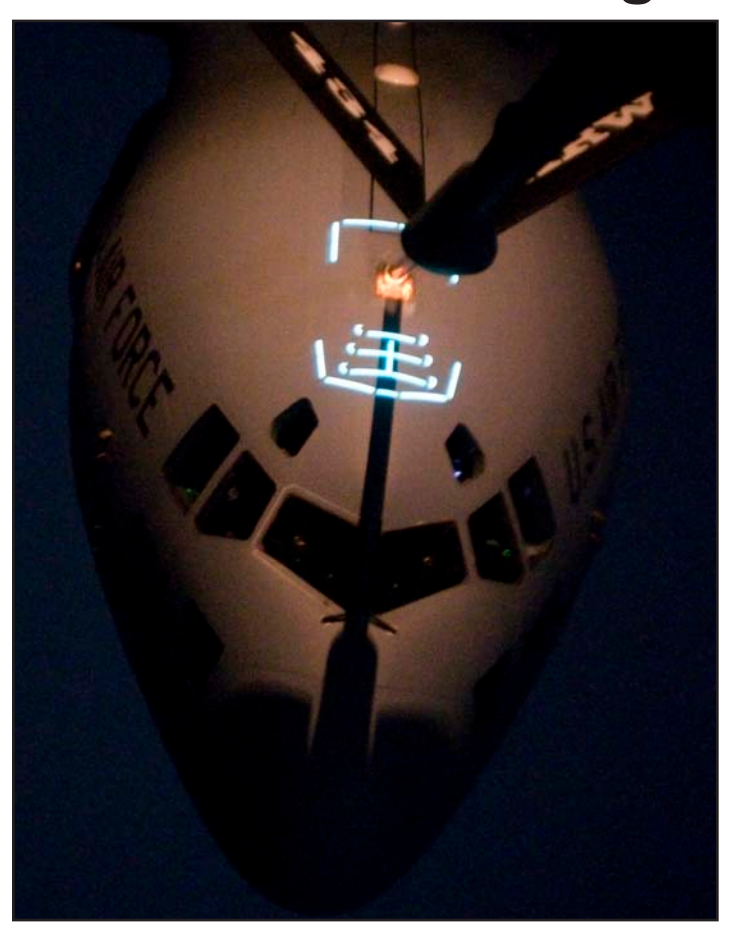
A Grissom KC-135R refuels a C-17 March 2 over Southwest Asia. Grissom Airmen deployed to the region January-April.