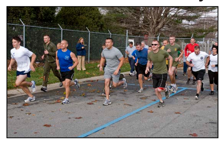
Grissom personnel take off from the starting line for a 5-kilometer 'turkey trot' here Nov. 15.