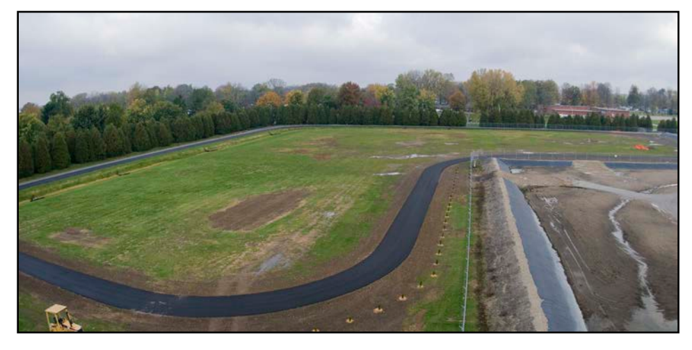
Grissom's new track, which is still under construction, is scheduled to be open for business in April 2012.

"The nice thing about it is we're reclaiming land that was unused,"