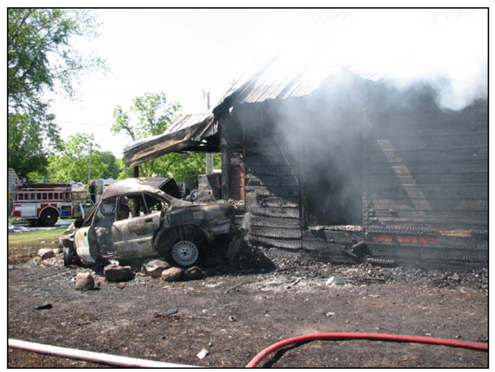
Grissom's Fire Department responded to this accident in the local community in 2009 -- one of more than 800 emergencies they responded to.