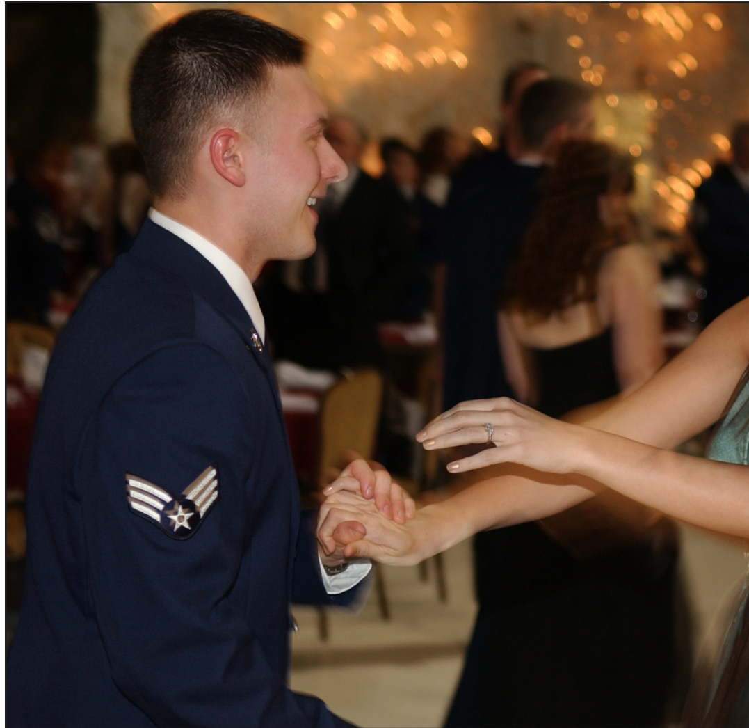
In celebration of the 60th Anniversary of the U.S. Air Force, Grissom hosted a military ball. The Air Force Band stationed at Robins Air Force Base, Ga. The guest speaker of the evening was Force Reserve Command commander.

All in all it was an evening filled with laughter and joy attendees danced the night away while listening to the band and remembering all of the sacrifices that Airman, civilians and family members have made to get the Air Force Reserve where it is today.