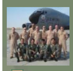
January: Grissom air crew members peformed the very first aerial refueling mission with the Pakistan air force during Exercise Iron Falcon 0701.

And though that all might sound like a lot, the men and women of the 434<sup>th</sup> ARW have been involved in so much more. Deploying, training and serving around the world, Grissom's finest have continued the tradition of being the "Unit of Choice" in 2007.