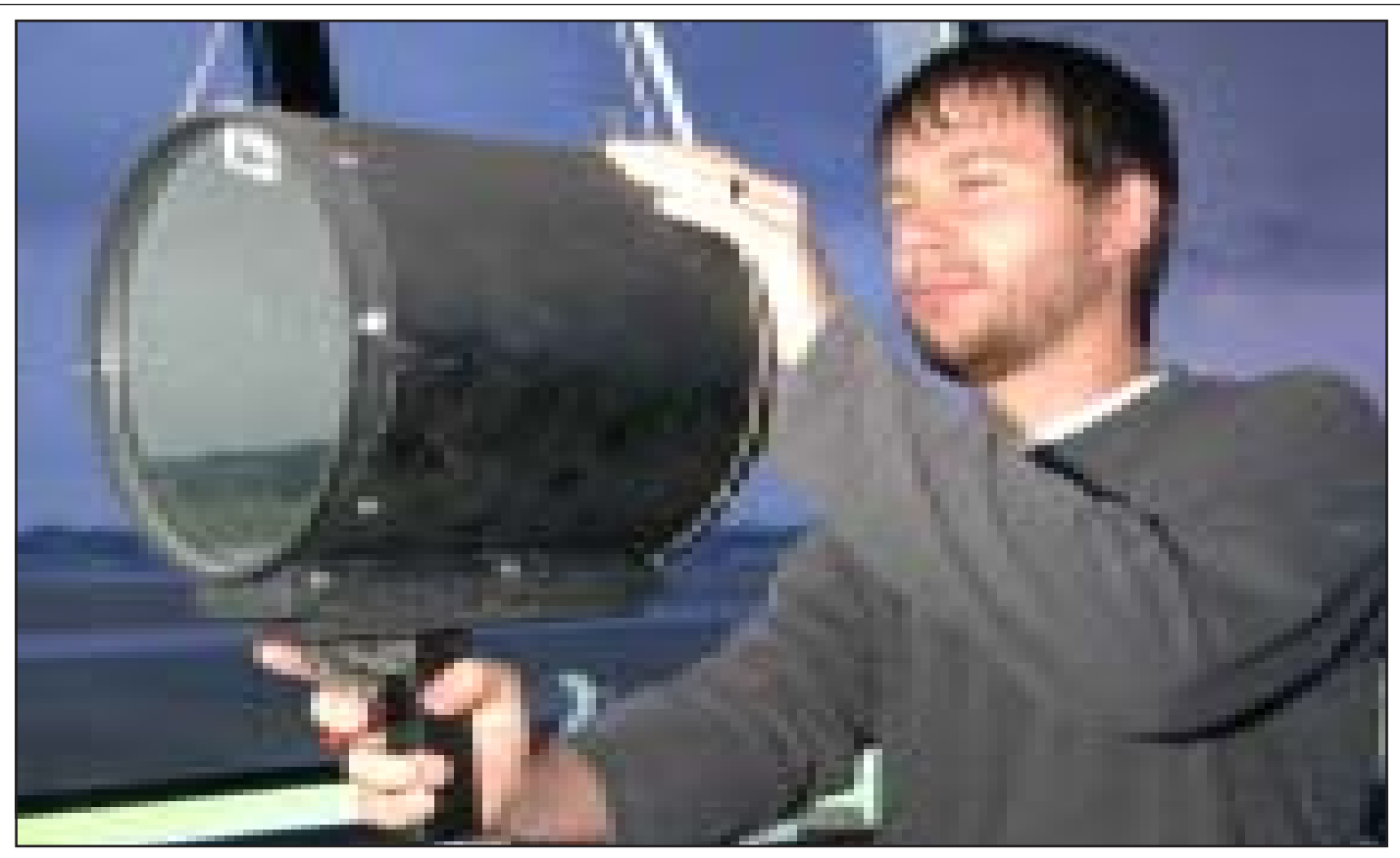
Spotlight on safety