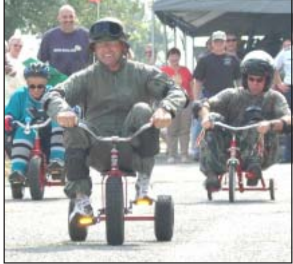
Commanders will once again compete in a tricycle race. The legs start pumping at 11:30 a.m.

Fort Benjamin Harrison's commissary will be hosting a case-lot sale during Sept. 9 during the Joint Services September 2006