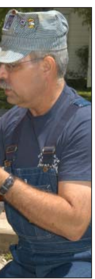
speeder car's vaporizer. le cylinder engine as it

that one of the most things about traveling via r or speeder is the expreseople's faces as he rolls railroad crossing. 's faces have the expresneone seeing a Model-T ey Steamer from a he said with a big ed grin.