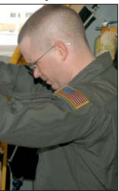
h the 72nd Air Refueling Squadron, Services Inc., as he maneuvers a 135R Stratotanker.