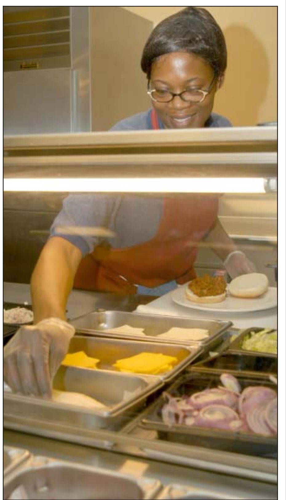
Now serving you....

The FSC will also sponsor a spouses coffee at 2 p.m. March 6 at the center. All spouses are invited to attend.