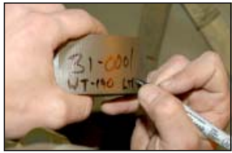
Dimensions on duct tape make for easy labels on cargo boxes.